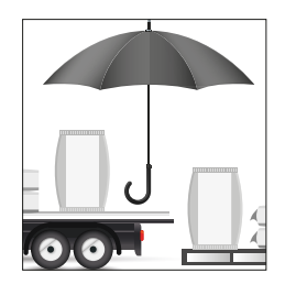
Page 1 / 3